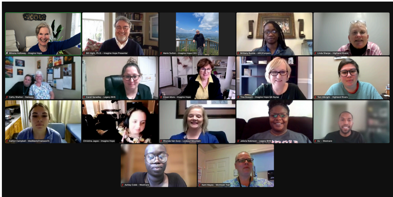
INSTI HIV Testing & Prevention Counseling / Part 2 (aka Booster) - March 30, 2022