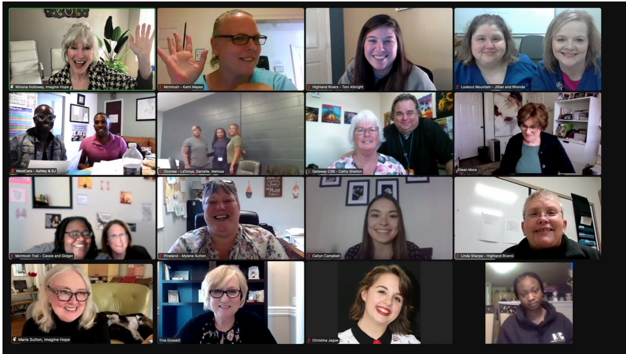
INSTI HIV Testing & Prevention Counseling / Part 1 - March 3, 2022