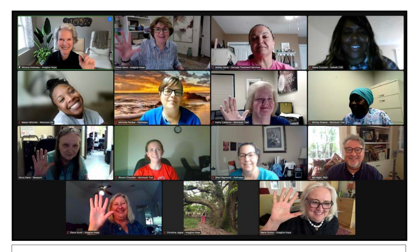
INSTI HIV Testing & Prevention Counseling / Part 2 - August 24, 2023