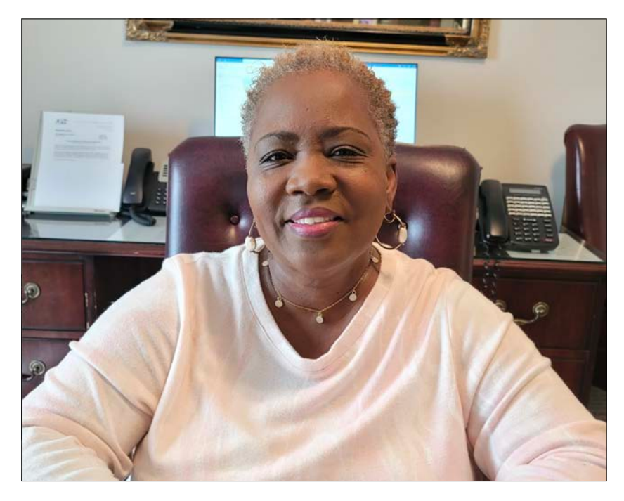
Easy Listening at New Beginnings

"I don't start off talking about HIV. I ask them how the day is going. So we're talking and then we're laughing and they just open up. People love for you to listen. Sometimes all they need is someone to listen."