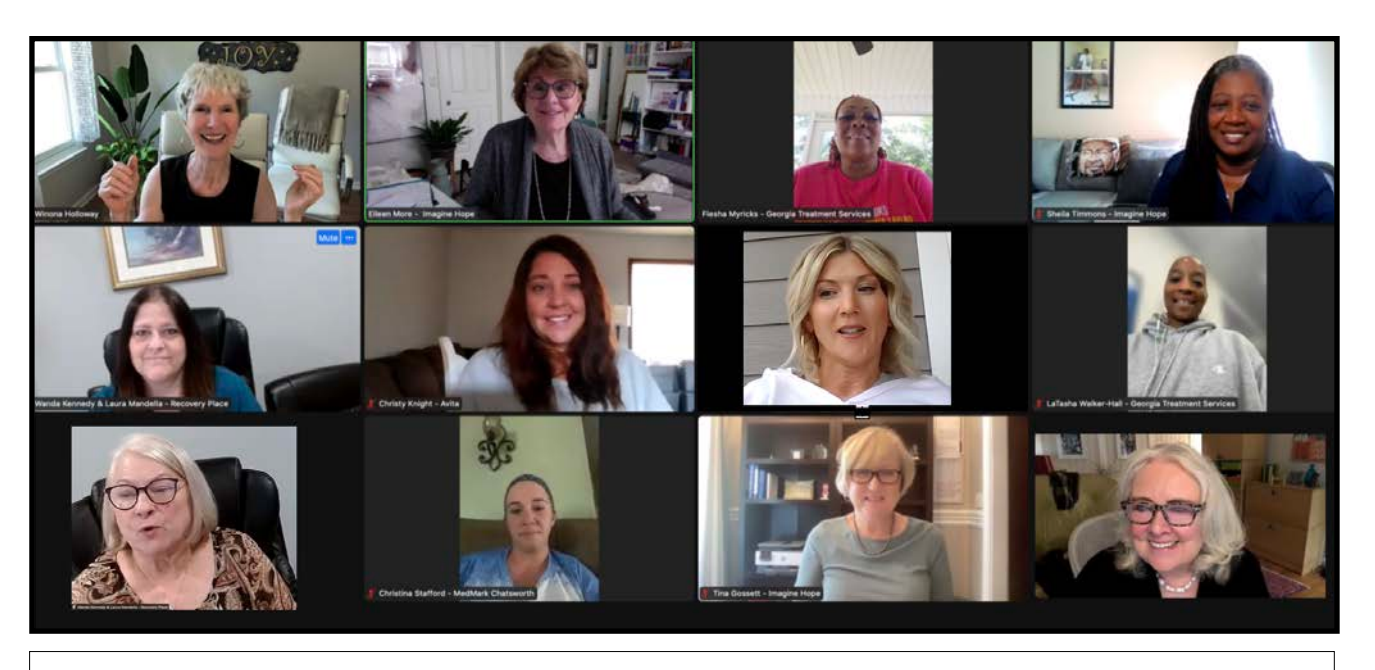
Serum-based HCV Training — September 28, 2023