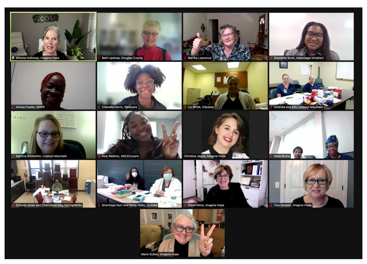
INSTI HIV Testing & Prevention Counseling / Part 1 - March 3, 2022