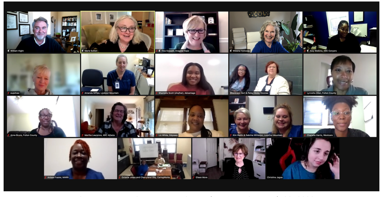
INSTI HIV Testing & Prevention Counseling / Part 2 - March 30, 2022