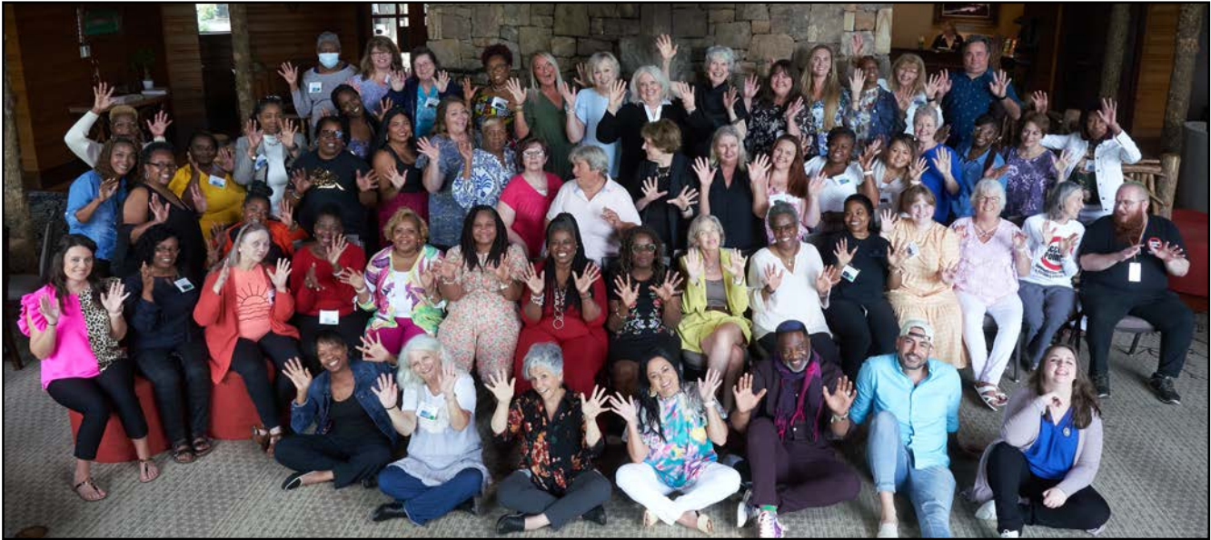
2023 Annual Gathering Group Photo

A program of DBHDD / Office of Addictive Diseases